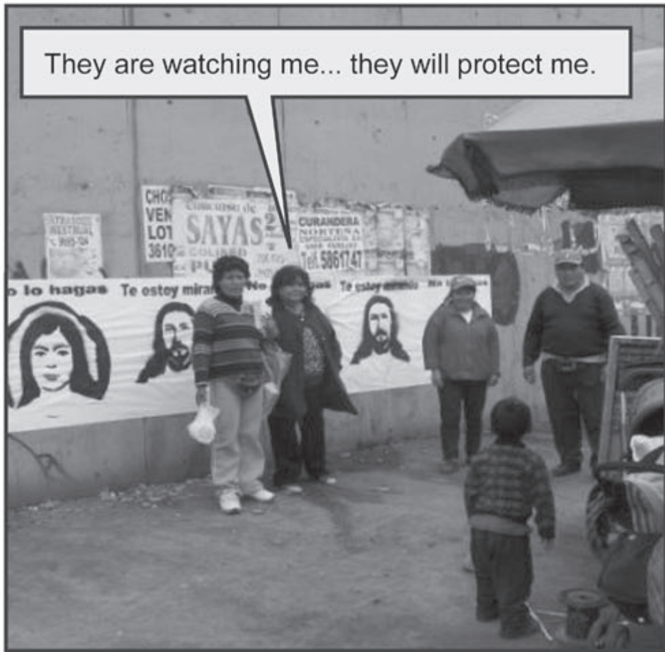
They are watching me... they will protect me.