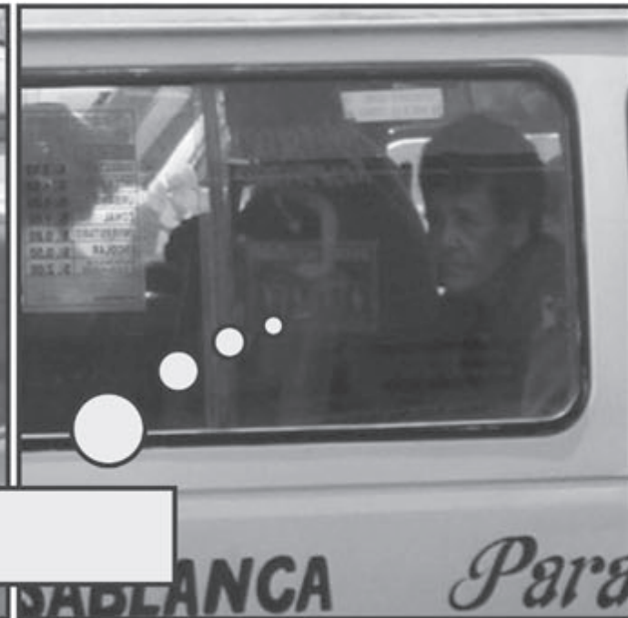
Astonishment! They are watching me! I'll better not do it.