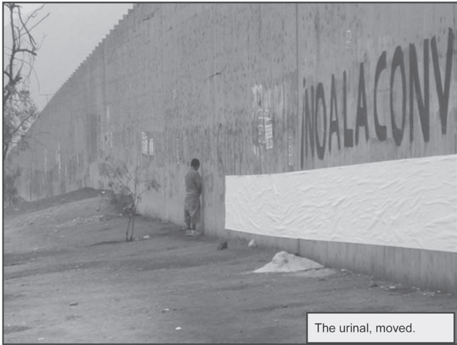
The urinal, moved.